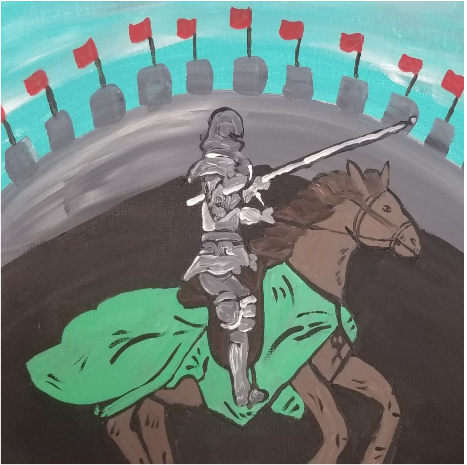
Sir Niall the Loyal